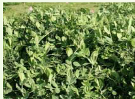
Austrian Winter Peas, May