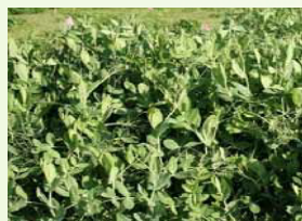
Austrian Winter Peas, May