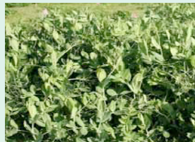
Austrian Winter Peas, May