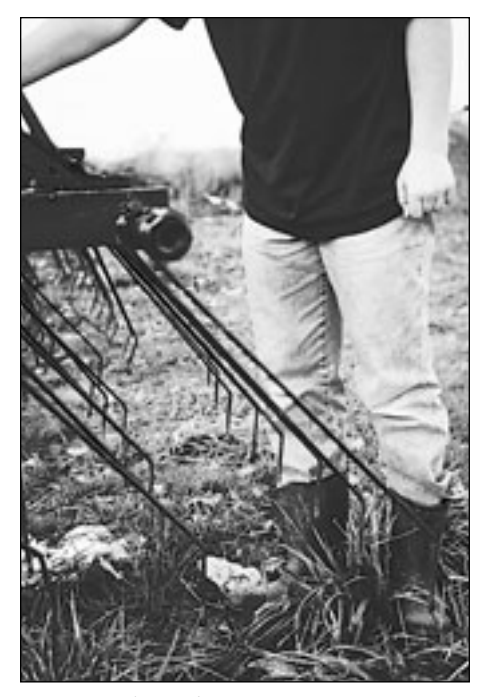
Kovar coil-tine harrow.

The planter frame and units should also be regularly inspected to insure they are not bent or warped. Retrofitting with shoes, firming points, specially designed seed tubes or "eccentrically" (on an angle) bored gauge wheel bushings will often result in more uniform seed placement than what the planter had when it was new. Trash wheels in front of the gauge wheels will sweep away clods and stones, making for a level surface and therefore uniform planting.