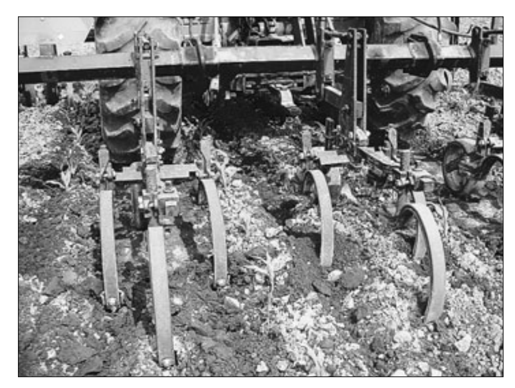
Cultivating corn, with view of IH133 rear-mount cultivator with C-shank teeth.

needs. It is important to consider planting disease-resistant varieties if certain pathogens are prevalent in the area. Any crop variety that is able to quickly shade the soil between the rows and is able to grow more rapidly than the weeds will have an advantage. Deep shading crops, which intercept most of the sunlight that strikes the field and keeps the ground dark, will prevent the growth of many weed species. Alfalfa, clover and grasses are particularly good shading crops because any weeds that grow in them will usually be cut when hay is harvested, thereby preventing weed seed production.