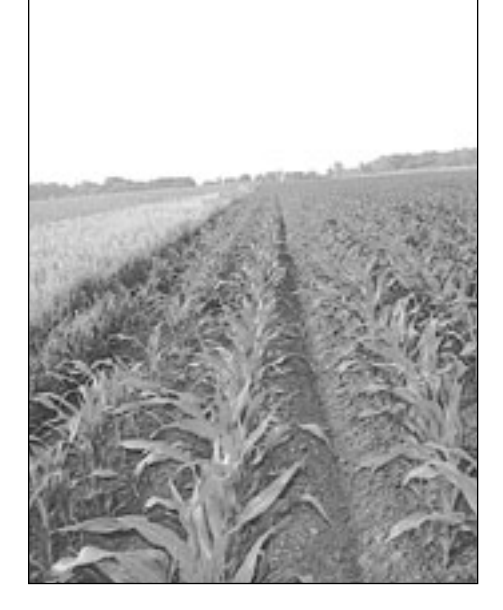
Corn (next to a field of oats/peas/barley) that has recently been cultivated for the second and last time with a high-clearance cultivator.