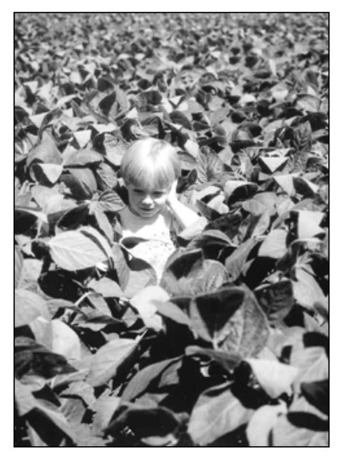
Daniel Martens in a field of soy shows the density of plants over the rows, effectively shading out weeds.

A deep shading crop is one that intercepts most of the sunlight that strikes a field, keeping the ground dark enough to smother any weed seedling soon after emergence. Ideally, such a crop should provide complete shading early in the season and maintain it as late as possible. It is desirable for the crop to be tall and give heavy shade that is high enough to prevent weeds from breaking through the canopy and growing above the crop, which would allow them to ma-