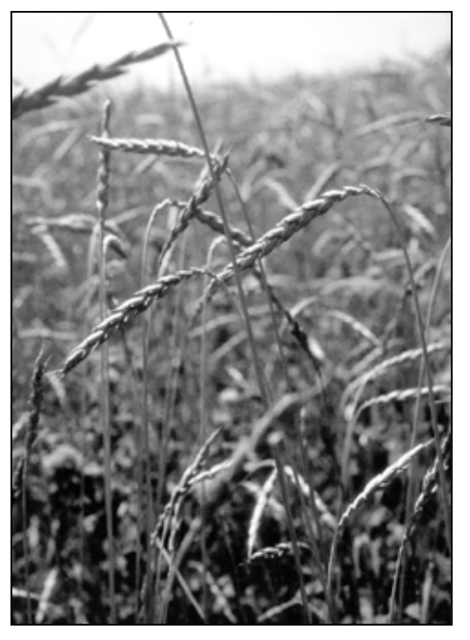
A field of spelt is interseeded with red clover. The clover is frost seeded into spelt and remains even after the spelt has been harvested, adding valuable organic matter and nutrients to the soil, and shading out weeds.

On soils with a CEC above 8, a 7:1 (percent saturation) calcium-to-magnesium ratio will probably be optimal for weed control and crop plant growth. This ratio, in particular, appears to be a key factor regulating weed population size and strength. When magnesium levels are high relative to calcium levels, high weed populations and soil compaction are more likely to result. The presence of weeds can be a clear indicator of which chemical components