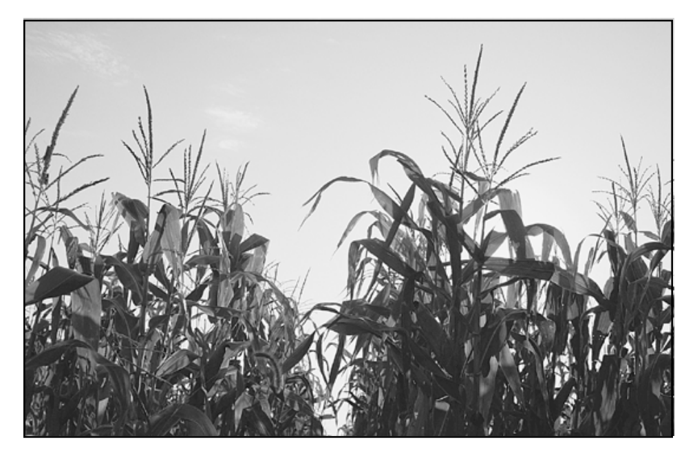
Increasing demand for non-GMO foods has caused farmers to stop and evaluate the risks to their organic operations, and to look for means to keep their crops GM-free.

The current model of organic farming is based around a host of similar organic standards enforced by different certification agencies. It describes a production or a management system. If an organic farmer manages the farm in a certain way, avoids certain unacceptable inputs, employs cer-