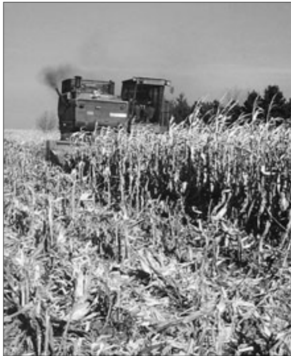
Combines should be operated at full throttle. At lower engine speeds, the machine will not do a complete job of threshing and cleaning, and there will be more damage and loss.

6. Use the correct cylinder/rotor speed and concave clearance to properly thresh and separate the crop. Most people run the cylinder too fast and the concave too tight. You want to thresh only hard enough to get the grain off the ears, any more than that increases the amount of trash the separators will have to remove. Excessive cylinder speed is the leading cause of grain damage, so use the lowest possible setting to achieve the best total threshing. Ideally, the concave clearance at the front of the machine should be about the diameter of an ear with kernels, while the concave clearance at the back should be the size of an empty cob. Adjust concave clearance first rather than cylinder